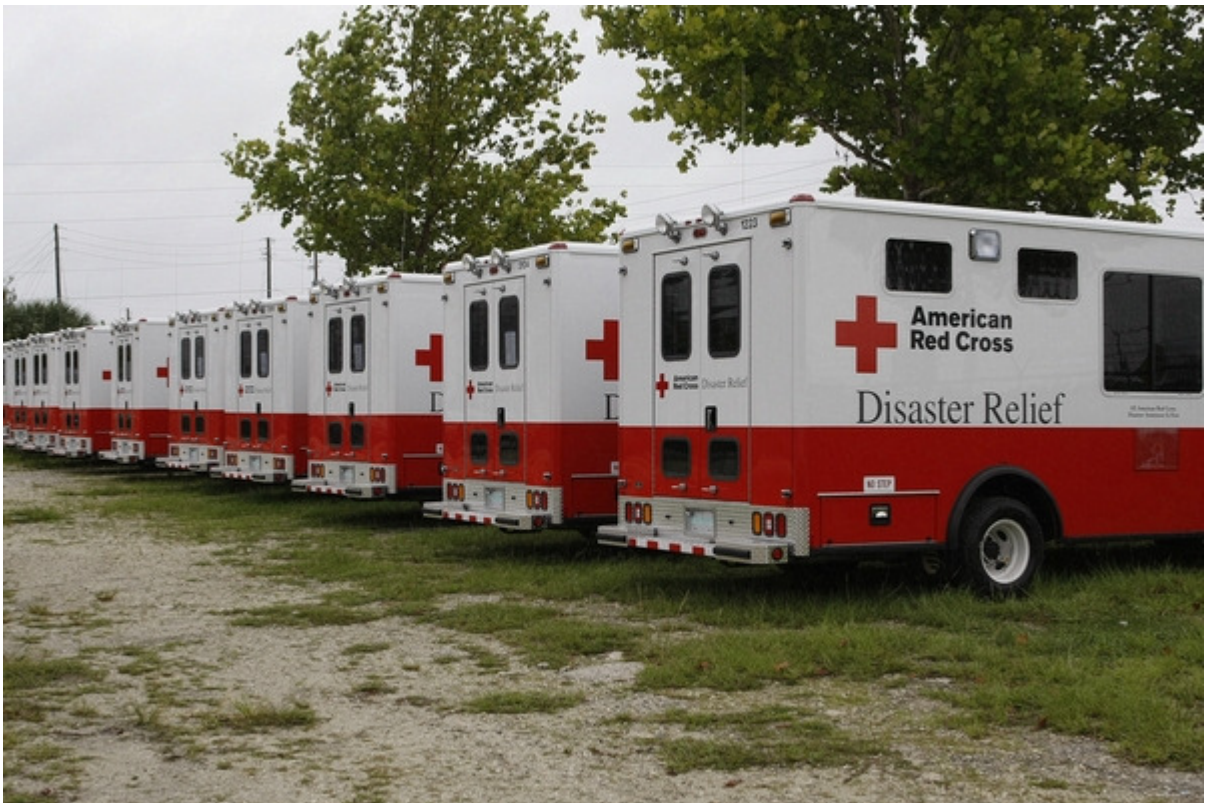
Aug 2008 - Florida